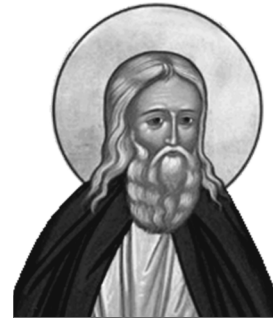
St. Herman Wonderworker of America