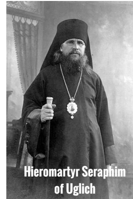
Hieromartyr Seraphim of Uglich