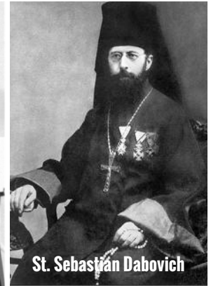
St. Sebastian Dabovich