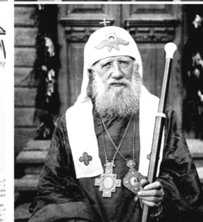
Hieromartyr Patriarch Tikhon of Moscow