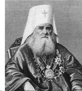
St. Innocent Apostle to the Aleuts