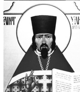
St Yakov Enlightener and Baptizer