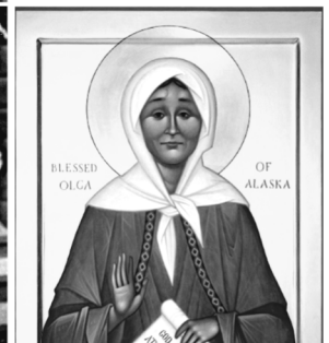
St. Olga Mother of All Alaska