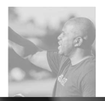
This is a Biblical issue

Nearly 700 Arizona Christian Pastors standing together to defend voiceless children and vulnerable women.