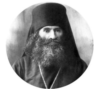
ST. ANDRONIK OF PERM PRAY UNTO GOD FOR US!

In 2000, the Russian Orthodox Church glorified him as Hieromartyr Andronik, Archbishop Of Perm, one of the Russian New Martyrs and Confessors. His feast day is July 7 on the Julian Calendar (Gregorian Calendar: July 20).