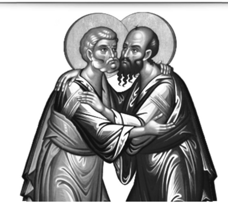
Remember, we are still in the Apostle's Fast